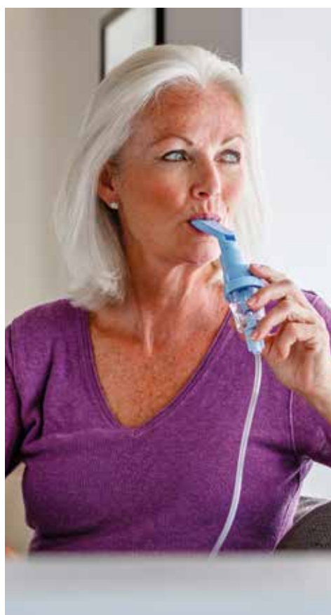
* Using 2.5 ml salbutamol